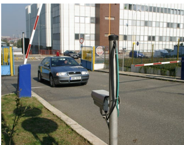
Entrance system – AŽD Praha Company Head Office