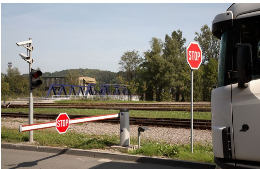
Entrance system – Trinec ironworks